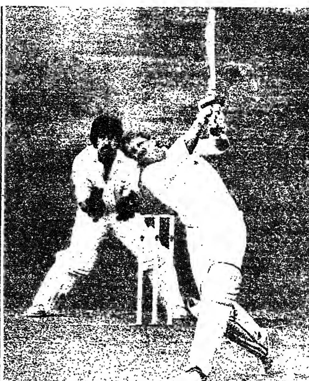
Ian Botham hitting a six on his way to his first century for England in 22 innings. Report page 16.

The National Coal Board yesterday issued its long-expected challenge to miners' leaders by announcing the immediate closure of two pits in militant coalfields regarded as test cases in the battle over economic collieries.